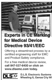
Call Ad not actual size